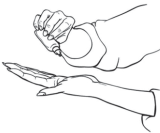
Figure 1. Dispense 10 drops of PENNSAID ® at a time

Step 2. Your total dose for each knee is 40 drops of PENNSAID ® . You will use 10 drops at a time. Put 10 drops of PENNSAID ® either on your hand or directly on your knee.